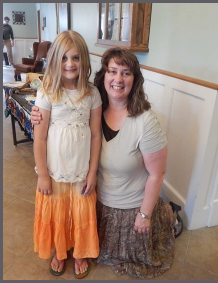
“Why does she do all that work?!”

Nashvillians, save the date— November 13!