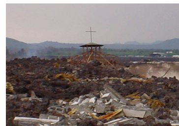
The cross of a church in Goma after the volcanic eruption in January 2002.

I wrote this to express my sincere thanks to all of you. Thank you for caring enough to give financially to our ministry. Thank you for caring enough to pray for us. Thank you for caring enough to keep informed by reading this. Thank you for caring!